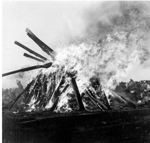
Too many dead for Christian burial

The Mayor and other notable figures, including it is rumoured, the Senator himself and said to be making their way back to Deadwood. Appeals for lumber and fresh water have been received from the Town Sherriff along with a general warning to stay well away from the Pyres to the west of town.